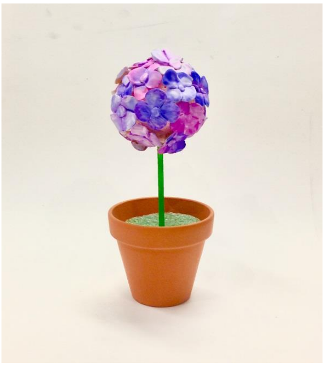
Submitted by Student Artist attending Wayland Middle School

The details of the Superintendent's Recommended Budget can be found at Superintendent's FY 2020 Recommended Budget